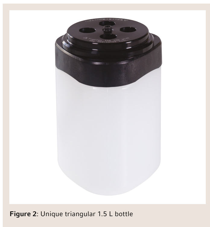
Figure 2: Unique triangular 1.5 L bottle

Presenting a unique and compact design, the R9A2 fixed-angle rotor allows to process 4 bottles of 1.5 L per run, with a total capacity of 6 liters. Suitable for both high-speed Centrifuges CR22N and CR30NX, this rotor is perfectly suited for harvesting of bacteria, algae, yeast, mammalian, or insect cell cultures with a maximum speed of 15,100 x g . In contrast to commonly used large capacity fixed-angle rotors, this rotor reduces the number of vessels to be handled by researchers from six to four with a similar centrifugation capacity. Thanks to this unique feature, process efficiency can be greatly improved without impacting the pelleting efficacy. As illustrated in the table below, precise labor time assessment of every successive step through two parallel bacteria harvesting workflows showed, that this solution allows to save 19 minutes in comparison with a conventional 6x1L capacity rotor, corresponding to 32% of the complete processing time.