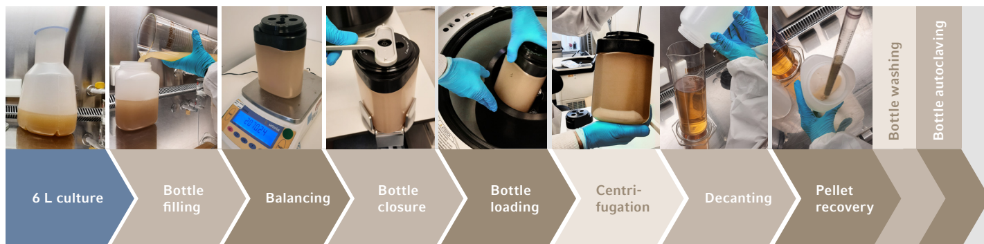
Figure 1: Handling steps in cell culture harvesting