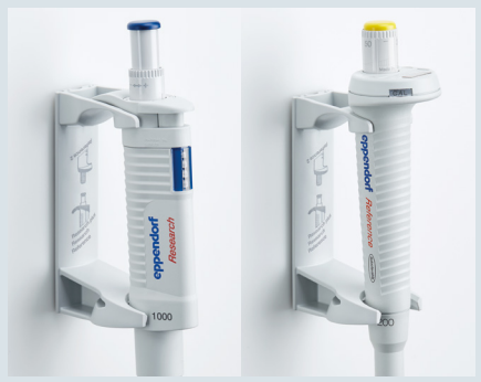
Downwards compatible holders for Eppendorf Research and Reference manual pipettes.

Large rubber feet protect carousels and stands from liquids spilled on lab bench.