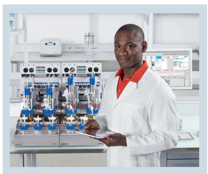
Figure 1 : DASbox Mini Bioreactor System for microbial applications equipped with BioBLU 0.3f Single-Use Vessels and autoclavable DASbox Mini Bioreactors with Rushton-type impeller.

This comparative study investigates the functionality and reliability of a BioBLU 0.3f single-use mini bioreactor and an autoclavable DASbox Mini Bioreactor (figure 2) in a small scale E.coli fermentation.