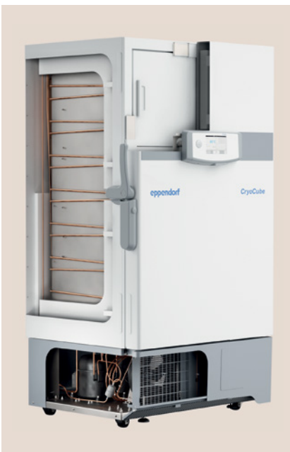
The CryoCube® F740hi ULT freezer is constructed with sealed cooling loops and only green gases to ensure adherence to regulations.

The ban of HFCs in Europe includes all cooling devices, with an exception for instruments that run temperatures below -50 °C (Article 13/3). Based on this exception, ULT freezers of -86 °C may continue to be produced with HFCs and can continue to run and be serviced. However, it makes sense to replace the HFC cooling liquids in new ULTs with the new ecologically-friendly green coolants as well - in order to counteract global warming.