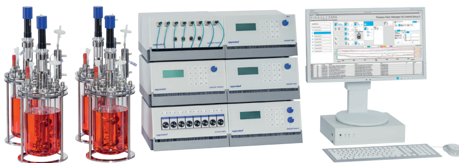
Fig. 1: Eppendorf DASGIP Parallel Bioreactor System for cell culture.

CHO cells were cultivated in a glucose-free formulation of EX-CELL® CHO DHFR-medium (Sigma-Aldrich® Co., LLC, USA) supplemented with 20 mM glucose, 4 mM glutamine, 1 µM methotrexate, 0.1% (v/v) Pluronic® F-68 (Sigma-Aldrich Co., LLC, USA) and 10 mL/L penicillin-streptomycin (Sigma-Aldrich Co., LCC, USA). Cells were cultivated for 7 to 9 days at 37°C using a four-fold DASGIP® Parallel Bioreactor System for