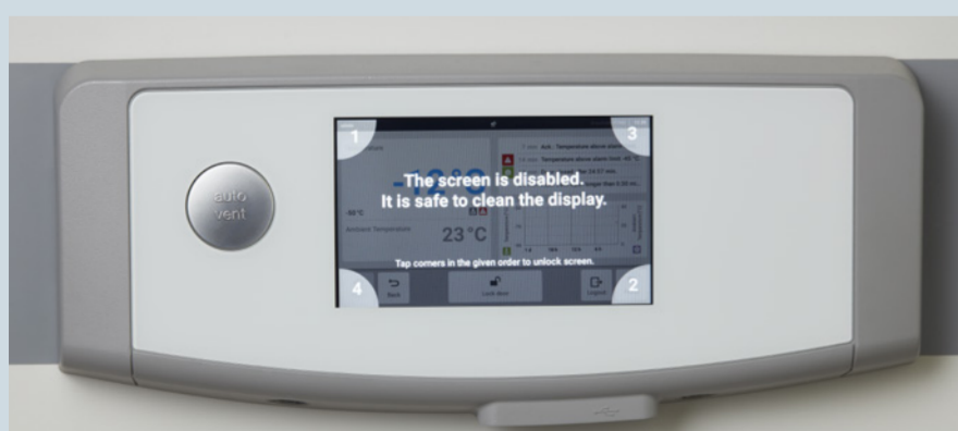
Touch screens can be cleaned by locking the screen: tap Menu > Clean Screen — the touch screen is now locked and ready for cleaning