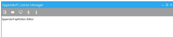
Fig. 7: Name of the imported license