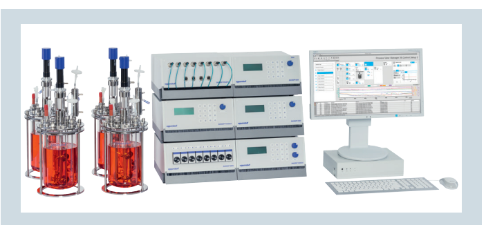
Fig. 1: Eppendorf DASGIP Parallel Bioreactor System for cell culture.

To ensure consistent drug quality and reduce batch-to-batch variability pharmaceutical companies and regulatory authorities aim to replace the "Quality-by-testing" with a "Quality-by-Design" strategy. In a QbD approach, critical quality attributes of the end product are defined and