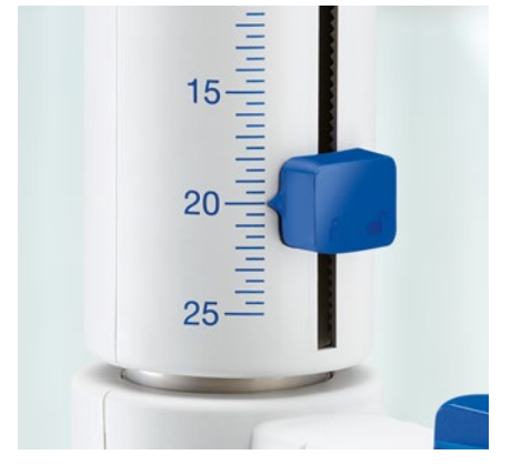
Optimized volume scale for clear visibility and precise volume adjustment

Recirculation valve lever for easy setting of recirculation or dispensing position