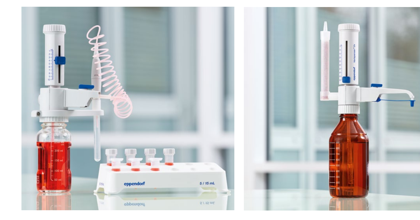
The flexible discharge tube gives you safe and direct access to your small and narrow test tubes and allows for fast and precise serial dispensing.