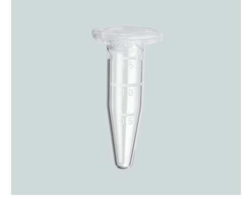
LoBind Tubes and Plates