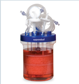
Fig. 1: BioBLU 5p Single-Use Vessel preloaded with Fibracel disks.

free CD-CHO medium (Life Technologies®, USA) was used throughout these experiments. The media contains 6.3 g/L glucose and was supplemented with 8 mM L-glutamine and 100 µg/ml of an antibiotic/antimycotic solution (Life Technologies, USA). Frozen rCHO cells were thawed and transferred to T-75 flasks with CD-CHO medium and allowed to expand. Once a sufficient number of cells were achieved, sterile disposable spinner flasks were utilized to further expand the cells. Subculture of the cells continued until a sufficient number of viable cells was achieved for use as a seed culture at the density of 5 \times 10^5 cells/mL. Both the glass bioreactor and the BioBLU 5p Single-Use Vessel were controlled with an Eppendorf bioprocess control station.