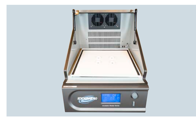
Optional drip pan: Protects the shaker drive below by collecting spills from the overlying universal platform

Platform alternatives (no universal platform required): The utility carrier (left) holds racks and vessels between adjustable cushioned cross rods (two rods included, extra rods available). The utility tray (right) comes with a non-skid rubber surface for low-speed applications that do not require vessel fixation.