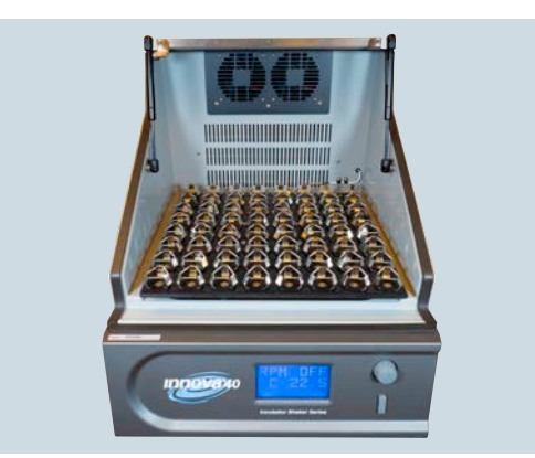
Maximum capacity: Various dedicated platforms come complete with clamps of one size pre-installed. They hold a greater number of clamps than the universal platforms, but do not offer the versatility to mix different vessel formats.

Flexibility for various vessel formats: Universal platforms are the versatile solution that lets you mix and match virtually any combination of Eppendorf shaker accessories—different sized clamps, test tube racks, microplate racks, etc. A sticky pad platform is available for low-speed shaking (200 – 250 rpm, depending on orbit) of flat bottom vessels.