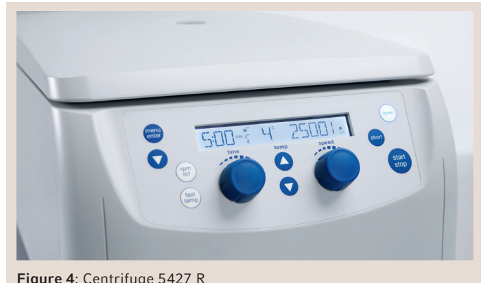
Figure 4: Centrifuge 5427 R