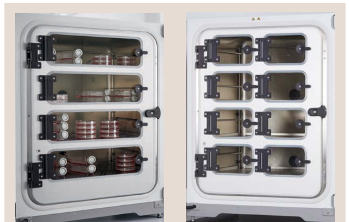
Fig. 1: CellXpert® C170i CO 2 incubators with different configurations of the inner door; with 4 segments (left) and with 8 segments (right)

Especially in larger cell culture laboratories, CO 2 incubators are often shared by several users. Multiple door openings during a workday cannot be avoided in most cases. Every time the door of an incubator is opened CO 2 and warm humid air escape from the incubator chamber. The larger the door and the longer the door opening time, the higher the loss of heat and CO 2 . When cells are cultivated under hypoxic conditions, the same is true for N 2 : the incubator is supplied with significant additional volumes of N 2 to suppress the ambient oxygen level. When working with sensitive cell cultures using a CO 2 incubator equipped with smaller segmented inner doors, as shown in Figure 1, has several advantages.