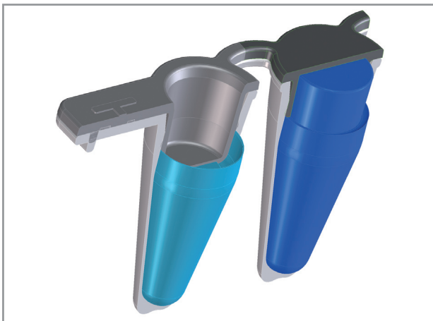
Figure 1: Vapor volume of 0.2 ml PCR tubes with different tube lids

Flat or domed lids are often used for sealing tubes and plates during PCR and real-time PCR. In contrast, the Eppendorf Masterclear Cap Strips feature an inverted dome, which reduces the vapor pressure volume of a tube (Figure 1).