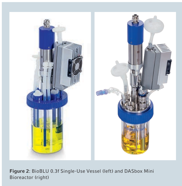
Figure 2: BioBLU 0.3f Single-Use Vessel (left) and DASbox Mini Bioreactor (right)