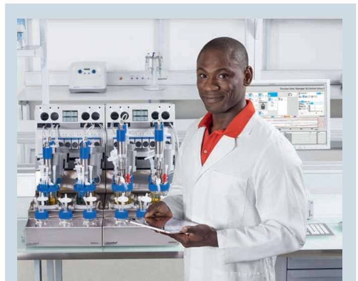
Figure 1: DASbox Mini Bioreactor System for microbial applications equipped with BioBLU 0.3f Single-Use Vessels and autoclavable DASbox Mini Bioreactors with Rushton-type impeller.

This comparative study investigates the functionality and reliability of a BioBLU 0.3f single-use mini bioreactor and an autoclavable DASbox Mini Bioreactor (figure 2) in a small scale E.coli fermentation.