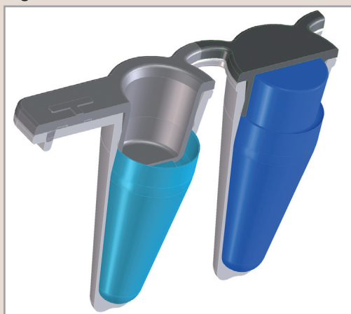
Vapor volume of 0.2 ml PCR tubes with different tube lids

On the right, the vapor volume resulting from the use of a flat lid (dark gray) is shown. Using the Masterclear Cap Strips (light gray), the vapor volume is reduced.