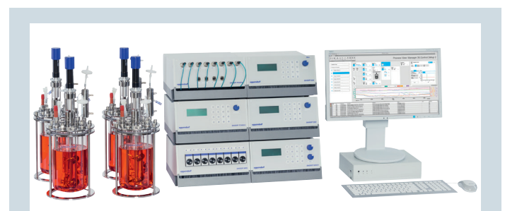
Fig. 1: Eppendorf DASGIP Parallel Bioreactor System for cell culture.

To ensure consistent drug quality and reduce batch-to-batch variability pharmaceutical companies and regulatory authorities aim to replace the "Quality-by-testing" with a "Quality-by-Design" strategy. In a QbD approach, critical quality attributes of the end product are defined and