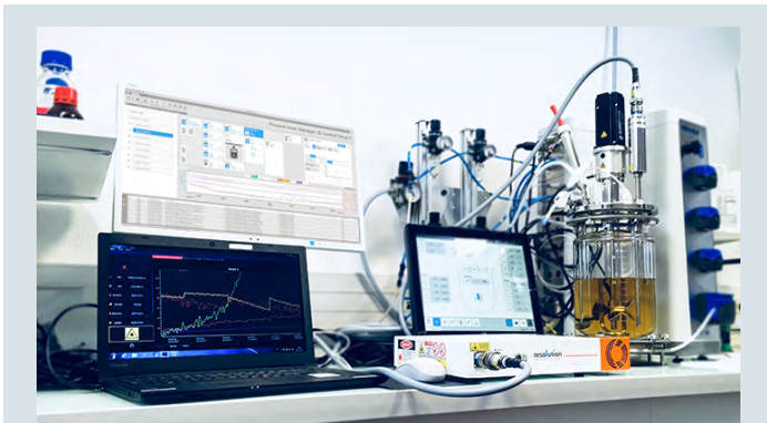
Fig. 1: Illustration of the complete system setup with the ProCellics probe inside the bioreactor controlled by DASware control 5.