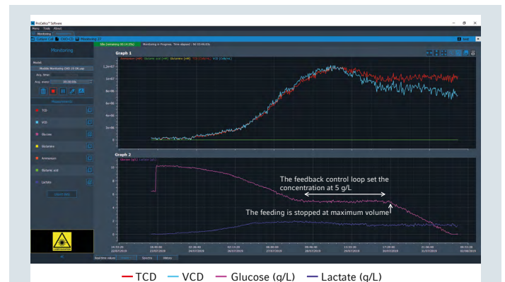
Fig. 4: Cell culture parameters evolution over the cultures, displayed on ProCellics Software.

As a control, a classical fed-batch run with manual glucose addition was performed (Figure 3B). The cell growth kinetics and the maximum cell density in the feedback-controlled run was comparable with the classical fed-batch control run. However, the lactate concentration in the feedback-controlled run was lower (2g/L) in comparison to the control run (3g/L). This is a noteworthy result, since to high lactate concentrations can be toxic for cells.