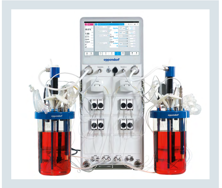
Fig. 1 SciVario twin bioreactor control system.

be a future-proof solution. Developed following the Agile principles, future updates will allow users to run vessels from as small as 0.3 L to as large as 40 L, on the same controller. Our 3 L CHO culture reached its highest density of over 17 x 10<sup>6</sup> cells per mL by day 11 with minimal human intervention. The experiments demonstrated both the capability of fed-batch cell culture and the flexibility of the SciVario twin platform.