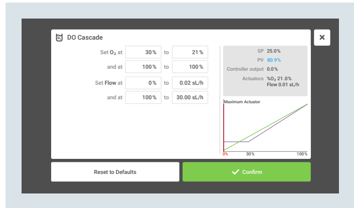
Fig. 2: VisioNize-onboard user interface - DO cascade screen