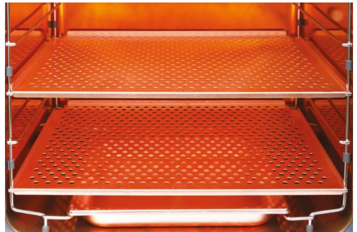
Figure 2: Copper chamber with available copper water tray and shelves

Your local distributor: www.eppendorf.com/contact Eppendorf SE · Barkhausenweg 1 · 22339 Hamburg · Germany eppendorf@eppendorf.com · www.eppendorf.com