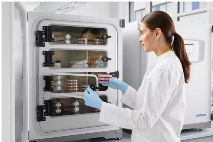
Figure 3: 4/8-segmented inner doors available