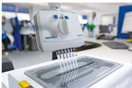
Calibration services by the experts