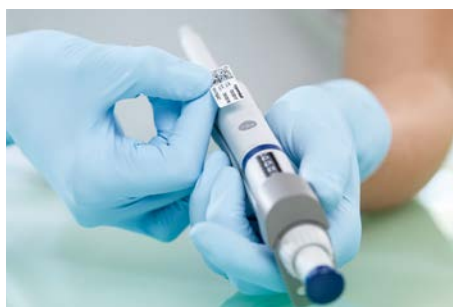
Next calibration due sticker