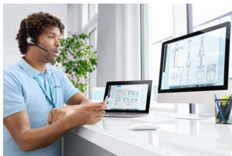
Ordering via the Eppendorf Service Portal