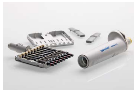
Maintenance and repair by the manufacturer