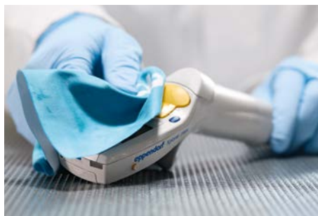
External and internal cleaning