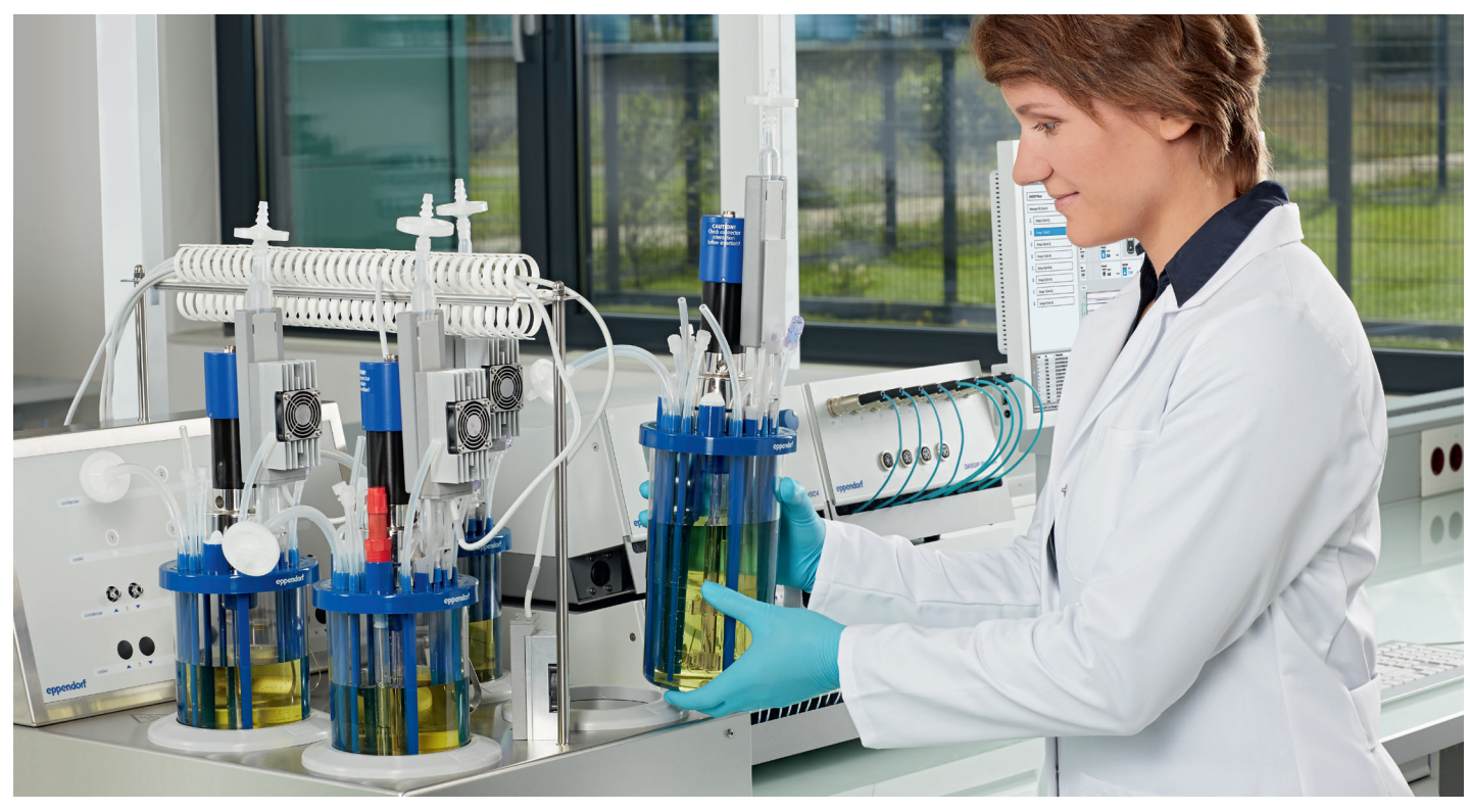
4-fold individual temperature control supporting glass and single-use vessels: The DASGIP Bioblock

DASGIP TC4SC4 allows for active heating and optional cooling as well as continuously adjustable stirring speeds as low as 30 rpm. It supports gentle cultivation of adherent cells on microcarriers or of suspension cultures, minimizing shear stress.