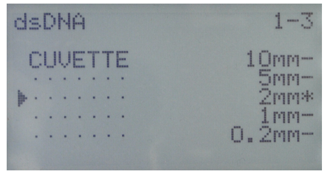
Fig. 2: Programming of the 2 mm light path in parameters for the method dsDNA

The use of the respective path length was taken into consideration during programming of the parameters in the BioPhotometer plus (fig. 2). The 10 measurements per dilution series were performed sequentially. A mean value was determined for each series of measurements, as well as the maximum deviation from the mean and the coefficient of variation.