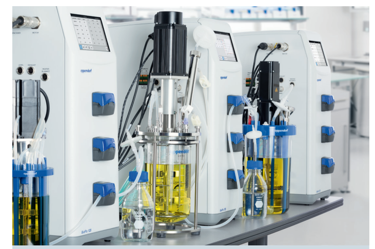
Fig. 1: The BioFlo 120 bioprocess control station equipped with fermentors for microbial applications.

Praj Industries Limited based in Pune, India, offers innovative solutions for beverage alcohol and bioethanol plants, brewery, water and wastewater treatment plants, critical process equipment and systems, and bioproducts. They tested the BioFlo 120 bioprocess control station (Fig. 1) for HA production in Streptococcus zooepidemicus , and in this application note describe the setup and operation of the fermentation process.