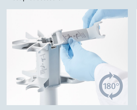
Downwards compatible holders for Eppendorf Research and Reference manual pipettes.

Rotatable holders carry all current manual Eppendorf pipettes and most predecessors.