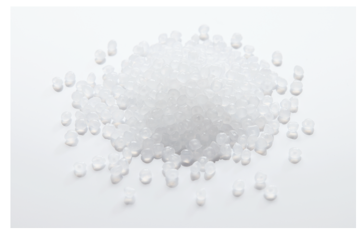
Figure 1: Polypropylene granulate

One of the most promising resources is used every day in the kitchens of restaurants, canteens or even at your home – used cooking oil (UCO). UCO is a mixture of triglycerides and free fatty acids and is, therefore, a good source of raw materials for many products, mostly used today to synthesize biodiesel, aviation fuel or lubricants, but it is also a useful source for other chemicals and products.