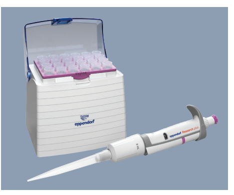
Precise one-step pipetting with Eppendorf pipettes and epT.I.P.S.® 5.0 mL