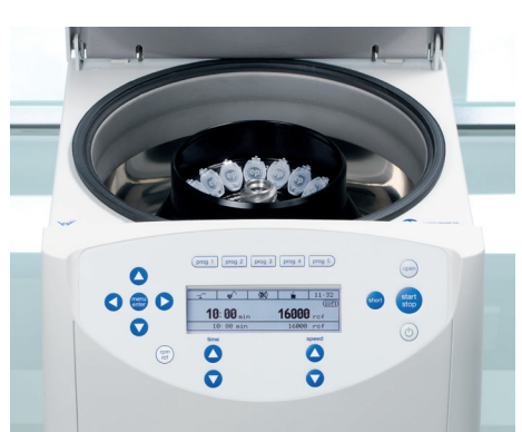
Safe centrifugation with Eppendorf Centrifuges