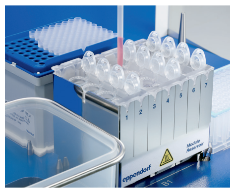
Easy integration in the ep Motion automated pipetting system