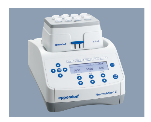
Perfect mixing, heating and cooling with the ThermoMixer C