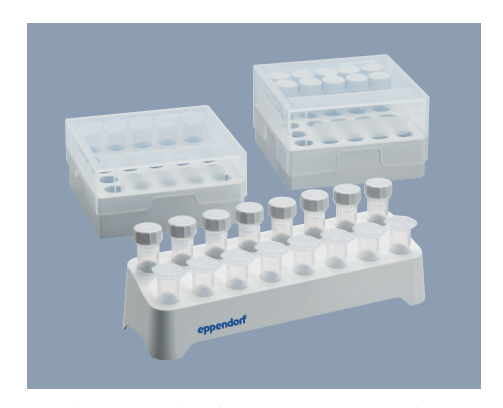
The ideal solution for sample preparation and storage: new racks and storage boxes