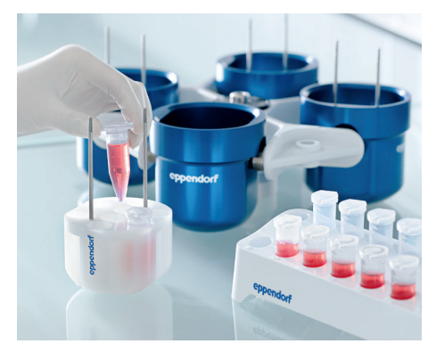
Optimized adapters for existing swing-bucket and fixed-angle rotors