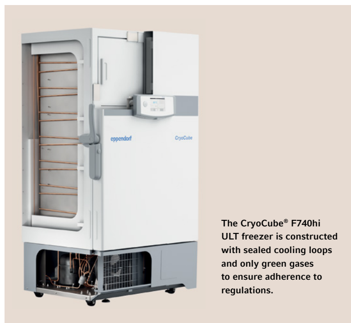
The CryoCube® F740hi ULT freezer is constructed with sealed cooling loops and only green gases to ensure adherence to regulations.

The ban of HFCs in Europe includes all cooling devices, with an exception for instruments that run temperatures below -50 °C (Article 13/3). Based on this exception, ULT freezers of -86 °C may continue to be produced with HFCs and can continue to run and be serviced. However, it makes sense to replace the HFC cooling liquids in new ULTs with the new ecologically-friendly green coolants as well - in order to counteract global warming.