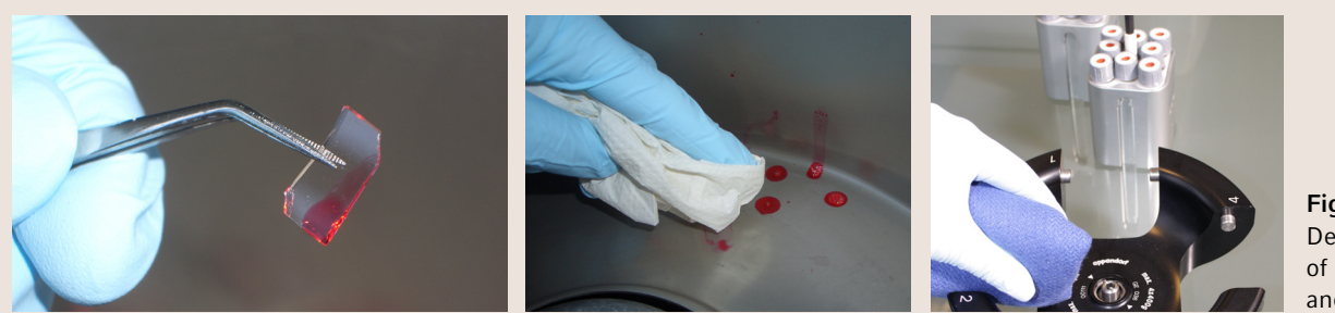
Figure 3: Decontamination of centrifuge, rotor and rotor buckets.

If necessary, remove still contaminated rotor, rotor lid, buckets, and bucket caps out of centrifuge to decontaminate areas which are difficult to access. After decontamination the equipment should be wiped with distilled water.