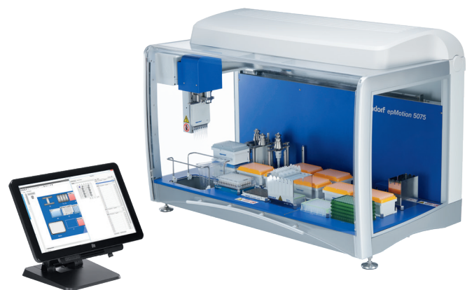
Figure 1: Eppendorf epMotion 5075t automated liquid handling system

The epMotion software has a user-friendly interface to guide the operator through the workflow, including placement of the labware, tools, and reagents. Before the run starts, an optical sensor verifies that all labware is correctly placed. The epMotion can be equipped with accessories for plate mixing, on-deck incubations, and magnetic bead separation. The automated platform allows for maximum walk away time.