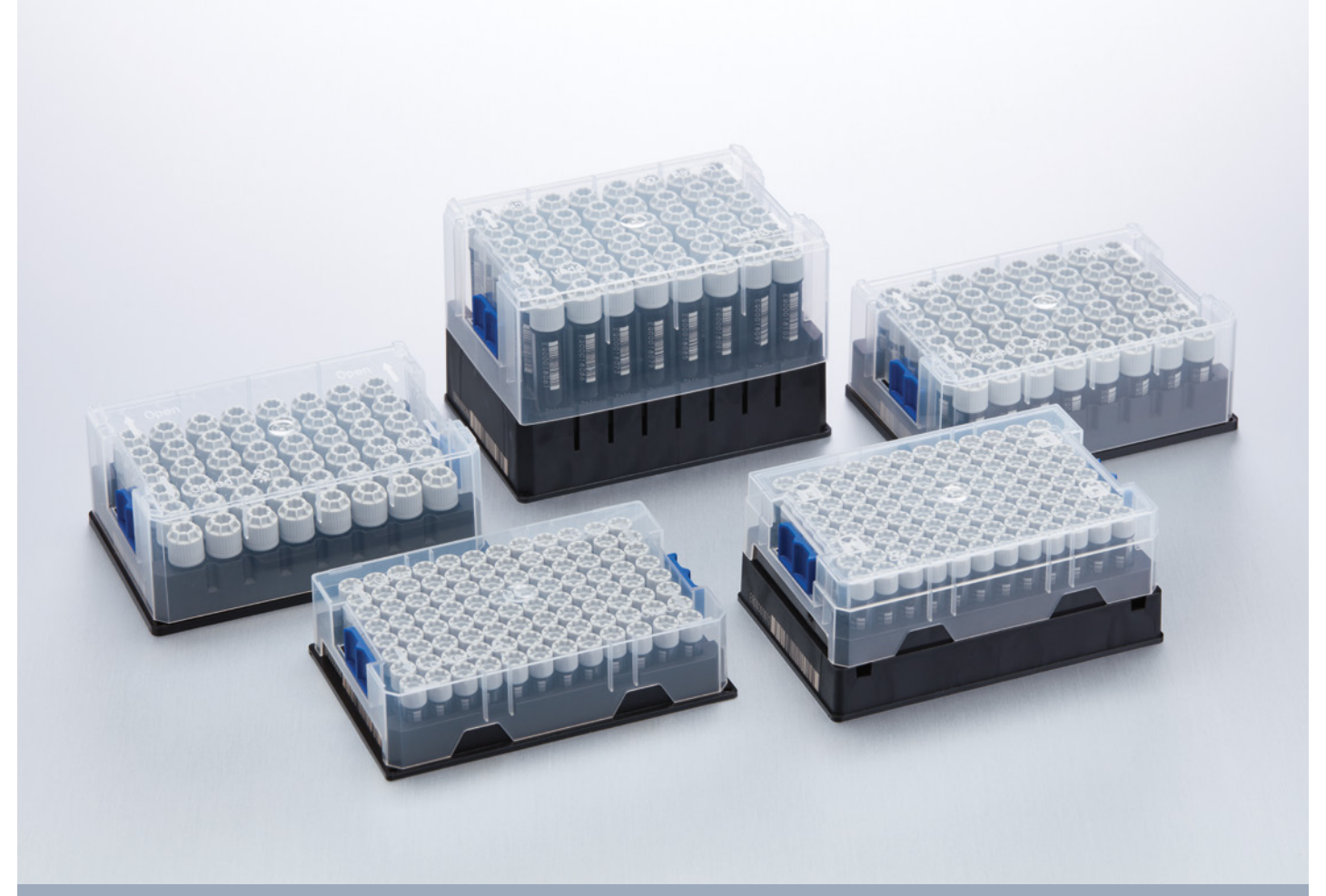
Using several volumes for your sample storage? Eppendorf CryoStorage Vials come in 5 different volumes: 0.5 mL, 1.0 mL, 1.5 mL, 2.0 mL, 8 4.0 mL. All are also available sterilized and ready-to-use.