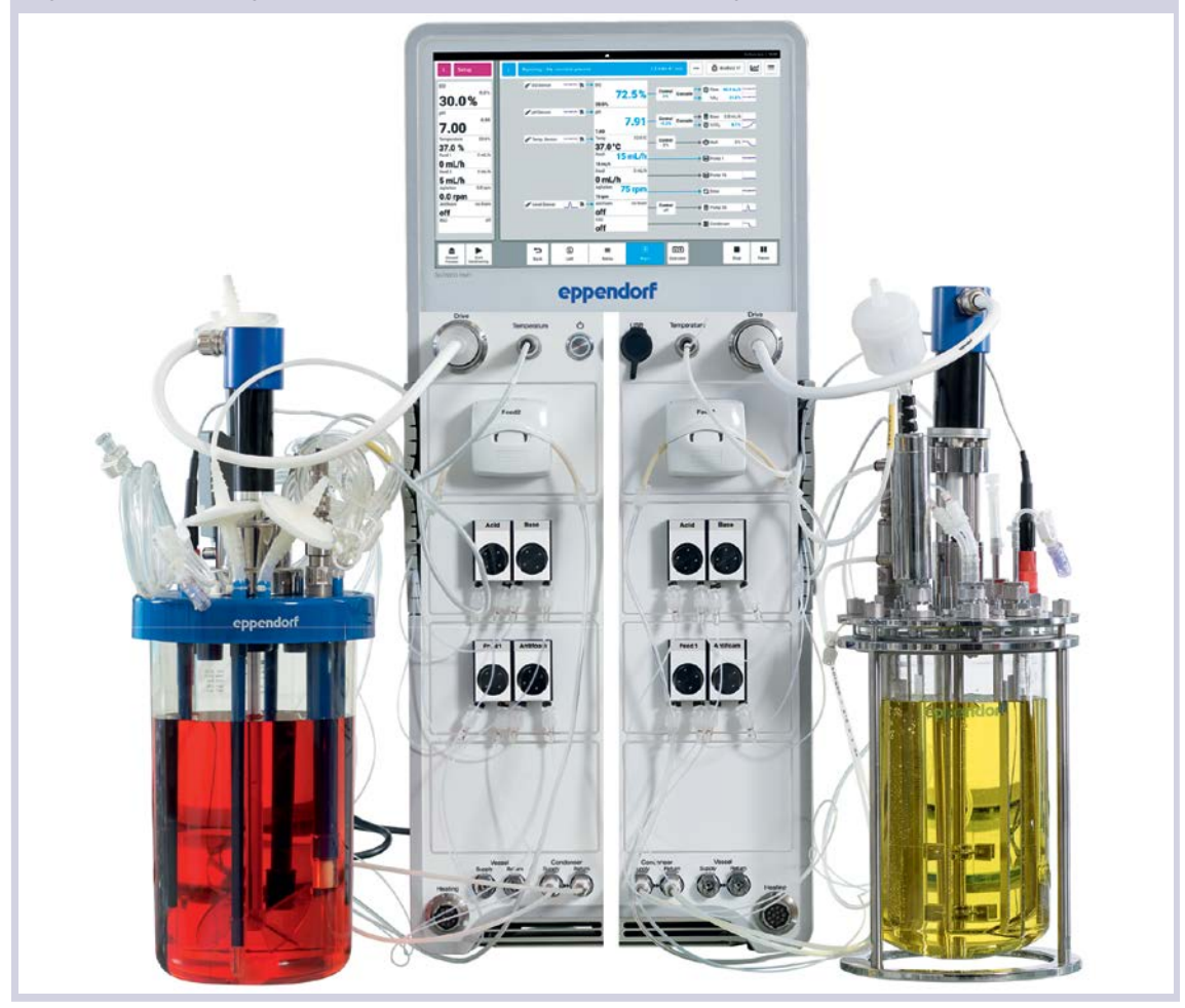
Figure 1: The SciVario twin controls cell culture as well as microbial fermentation processes in both BioBLU single-use vessels and glass vessels without the need of hardware changes.

Ready for the digital age, we now offer the first bioprocess twin controller, a modular bioprocess controller that can be flexibly adapted to the changing needs of our customers by support of our service technician.