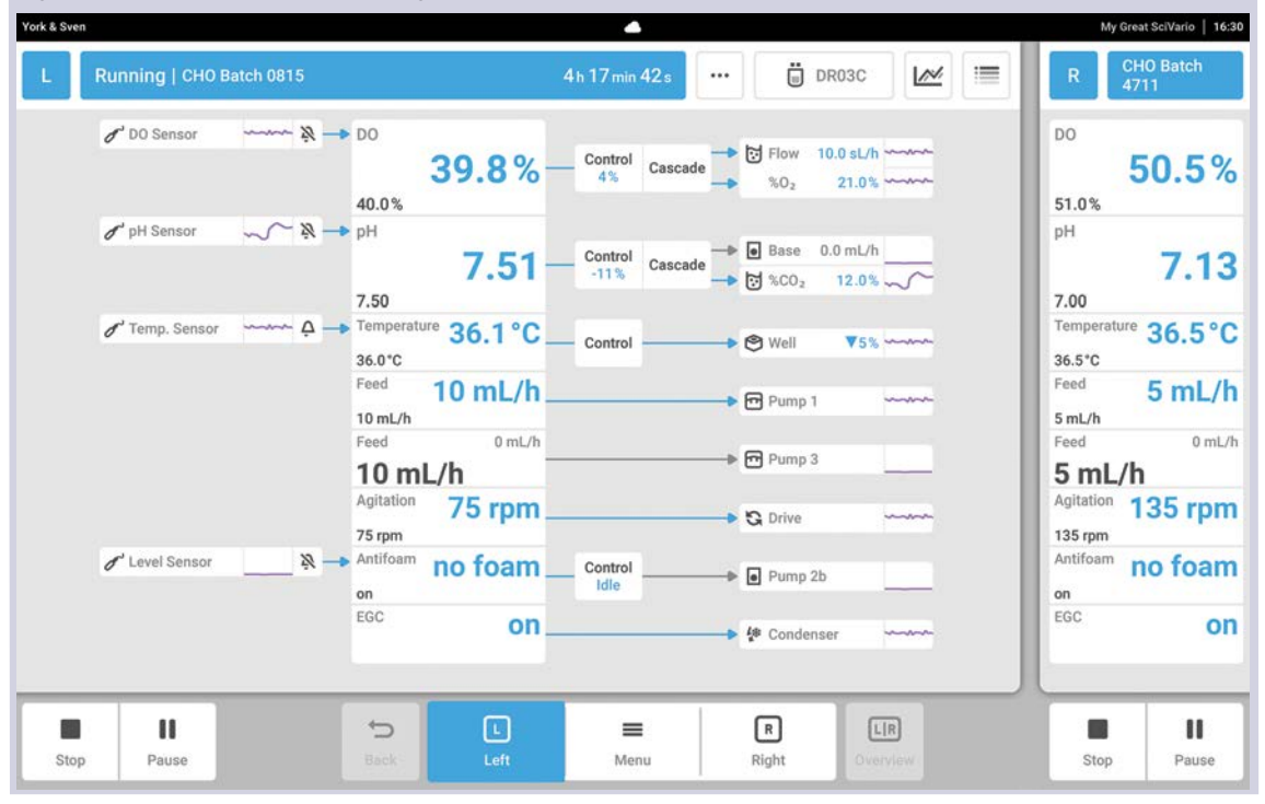
Figure 4: VisioNize-onboard comes with a structured user interface that shows all important process parameters at a glance. Small sparkline and event logs help to keep track of process performance.

The software recognizes the intelligent accessories and WARNS A USER when, for example, a vessel is selected that cannot be used with the connected drive.