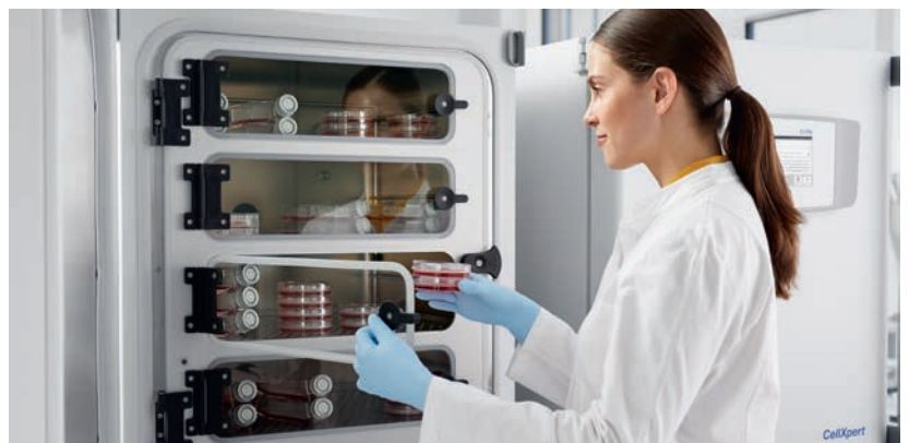
Available with small segmented inner doors to minimize hypoxia disturbance ( read more about the benefits of segmented inner doors in our White Paper )