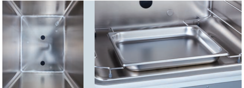
Nowhere to hide for contaminants and quickly cleaned: Smooth, seamless, and fan-less incubator chamber and removable water tray for proper cleaning and refill