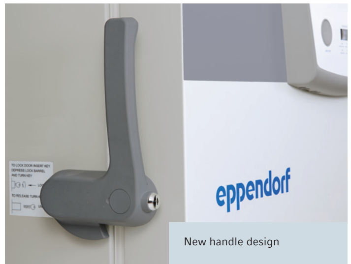
New handle design