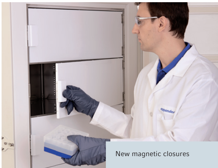
New magnetic closures