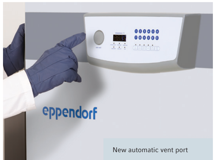
New automatic vent port