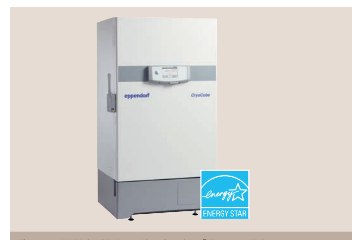
Fig. 2: An ENERGY STAR certified CryoCube® F740hi ULT freezer

While reviewing the manufacturers' datasheets can be helpful when standard protocols do not exist, there are standard labels available to compare the energy efficiency