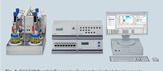
Fig. 1: DASGIP Parallel Bioreactor System for biofuel development

experiments to be run simultaneously using the shared equipment resources. Additionally, the DASGIP Parallel Bioreactor System's modular design provides ease of setup and maintenance, while offering the same control strategies and precision as larger scale production plants to achieve a reproducible and scalable process (figure 1) [2].