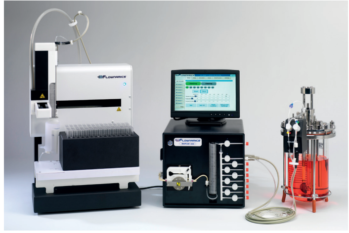
Fig. 2: Seg-Flow 4800 Automated On-line Sampling System with FlowFraction™ 400 Fraction Collector

*DASGIP Control is now DASware control 5. Please refer to ordering information on page 6.