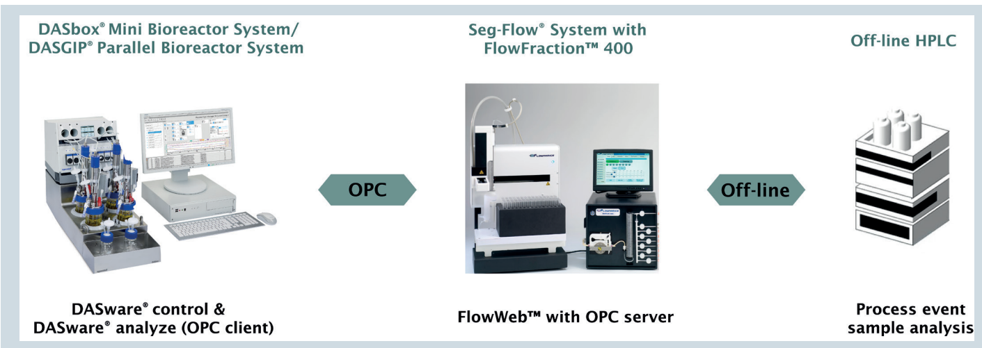
Fig. 4: DASGIP/Seg-Flow Process Trigger Sampling System. OPC communication permits continuous bi-directional communication between the Seg-Flow Automated On-line Sampling System and DASware control. The DASGIP/DASbox system detects the user-defined process event and remotely activates the Seg-Flow System to perform the process trigger sampling function.

automatically withdrawn from the bioreactor for sample collection and/or analysis. Upon completion of the sample collection or analysis, the data is communicated to the SCADA/bioprocess management system via OPC over the laboratory network. When the sampling functions and data transfer are completed, the Seg-Flow System returns to an idle status. The data retrieved from the Seg-Flow system can then be used for additional process monitoring and control options. This unique remote control function allows the process scientist to conduct "around-the-clock" monitoring and sampling of unique process events that could impact process productivity and/or product quality.