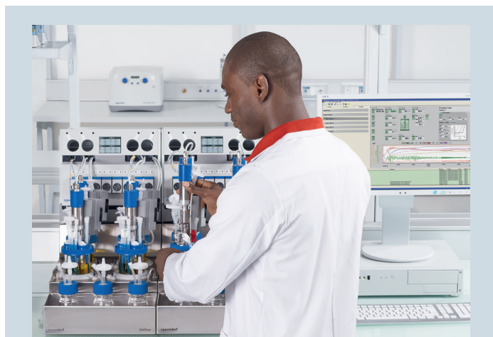
Figure 1: DASbox ® Mini Bioreactor System for Microbial Applications

proceed according to defined settings. DASGIP ® Parallel Bioreactor Systems have the potential to address process