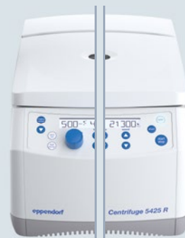
rotary knob version