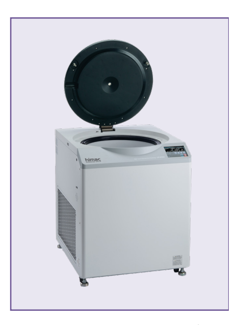
High-Speed & Ultracentrifuges<sup>1</sup>