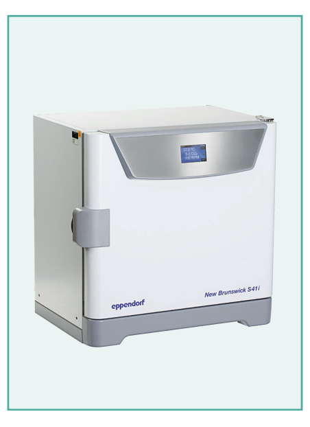
New Brunswick™ S41i