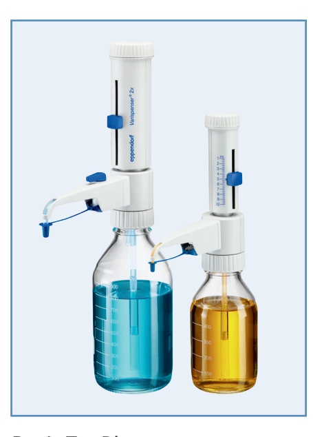
Bottle Top Dispensers