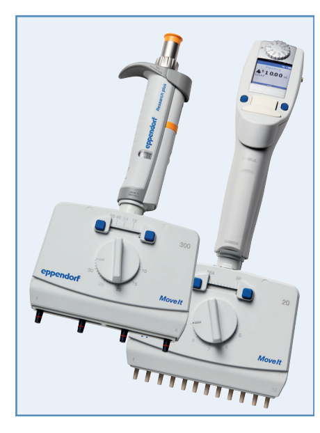
Adjustable Tip Spacing Pipettes