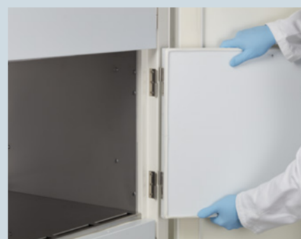
Remove inner doors for convenient cleaning