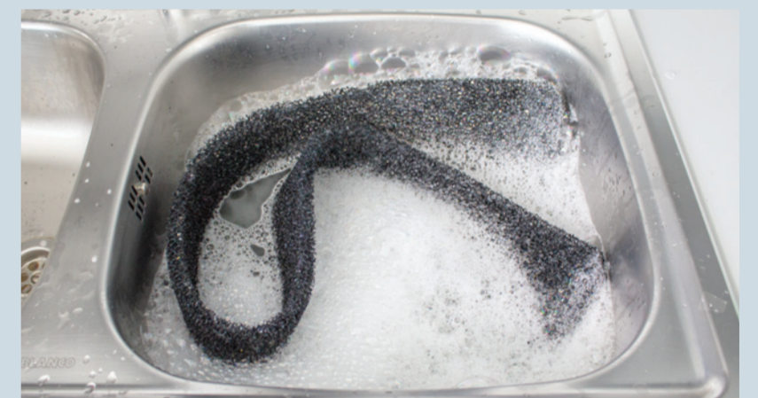
Wash the filter with a mild detergent