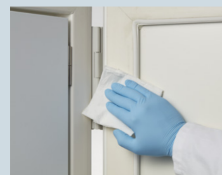
Wipe the outer door and its seal