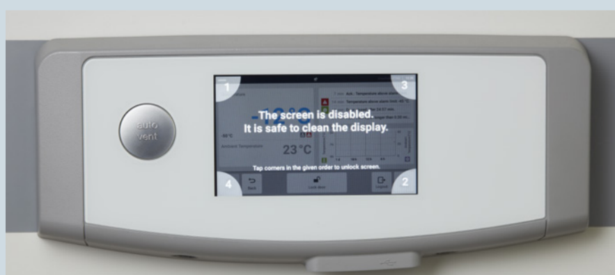
Touch screens can be cleaned by locking the screen: tap Menu > Clean Screen — the touch screen is now locked and ready for cleaning