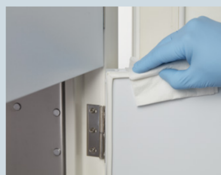
Wipe the inner doors and their seals