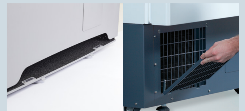
Remove filter from behind the filter grill