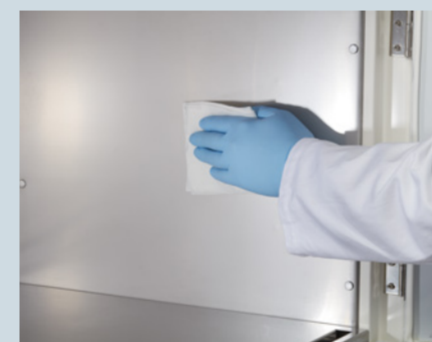
Wipe the inner chamber using a soft, lint-free cloth